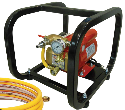
EHTP500C / EHTP500CE • with protective metal cage