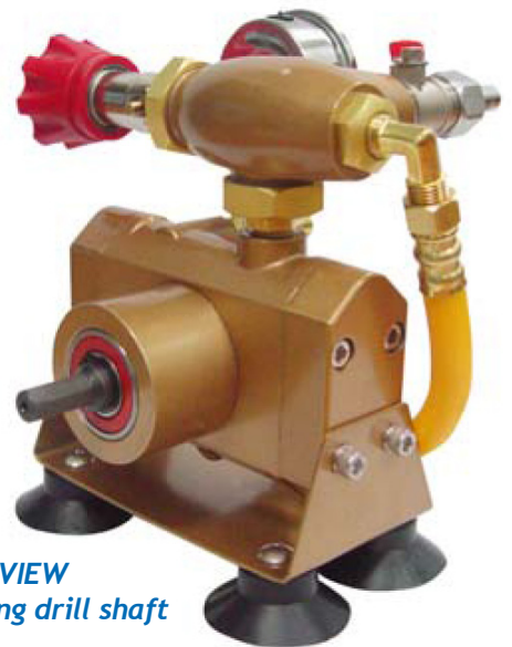
REAR VIEW showing drill shaft

*Inlet hose not included. GHT = Garden Hose Thread