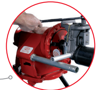
RGCOMBO2 with 5301PDCOMP (sold separately)

Manual Grooving 2-in-1 tool! Power Grooving