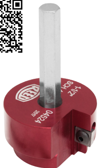
PPR150 - 04524 - 1 1/2"