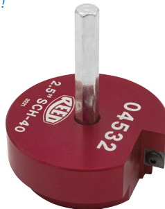
PPR250 - 04532 - 2 1/2"