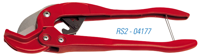
RS2 - 04177