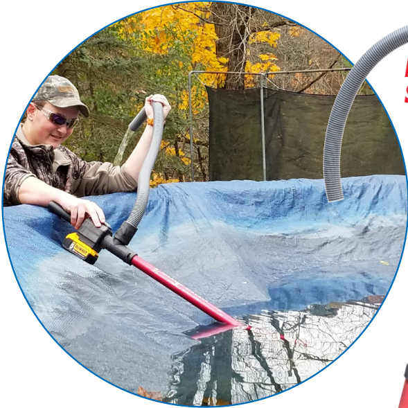
Cordless Water Transfer Pump

Quality Tools for Commercial Pools, Spas, Splash Pads, Water Parks, Hot Tubs and Fountains