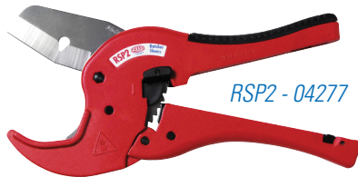
RSP2 - 04277