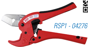
RSP1 - 04276